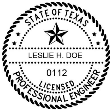
Figure: 22 TAC §137.31(c)